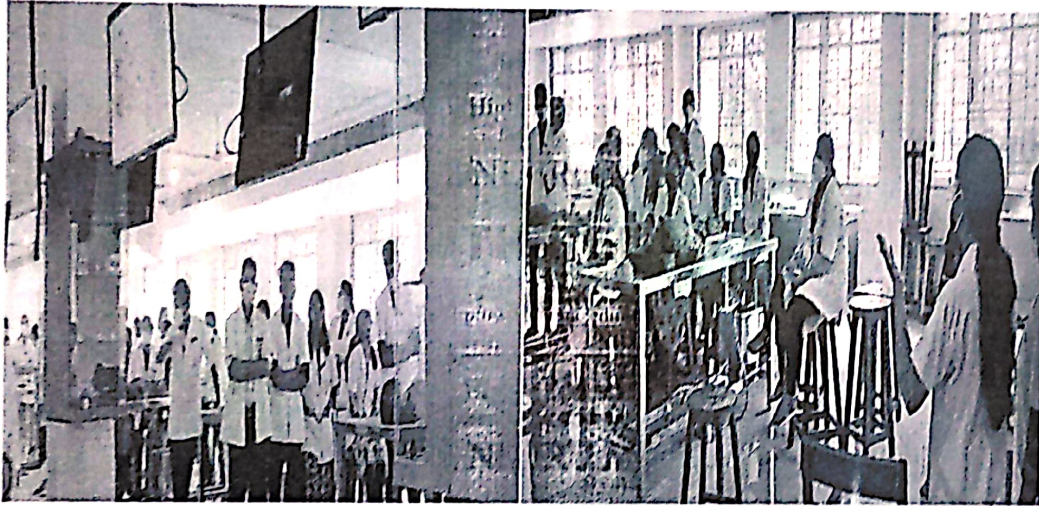
Photographs from the event

• Tel: 0831-2471350 • Website: http://www.jnmc.edu • Fax: 0831-2470759 • Email: jnmc.redcross2021@gmail.com