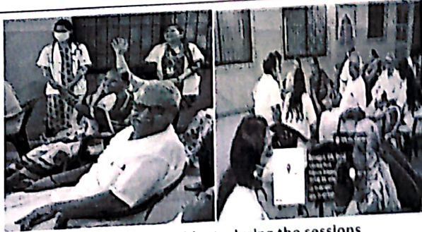
Happy residents during the sessions

• Tel: 0831-2471350 • Website: http://www.jnmc.edu • Fax: 0831-2470759 • Email: jnmc.yrcr2021@gmail.com