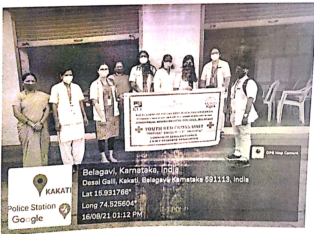
Group picture of volunteers, Nurses and ASHA workers who participated in the camp at Kakati PHC