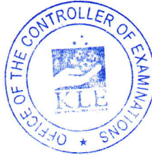
Controller of Examinations KAHER, Belagavi.

Kindly notify it to the concerned departments and display it on the college notice board prominently for information of the students.